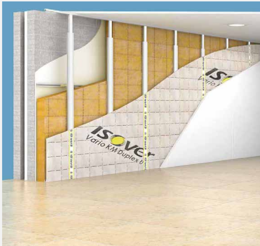
Wall lining system